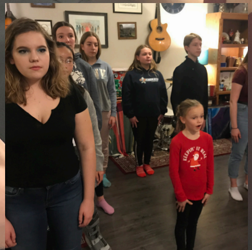
The CBY Music Choir in rehearsal Christmas 2019