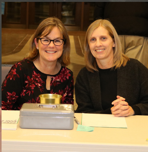
Parent Front of House volunteers Christmas Concert 2019

Whether you volunteer for our front-of-house, take part in our enrichment programs like The CBY Music Choir or just get involved in helping us to spread the word, our "CBY Family" is the anchor to everything we do.