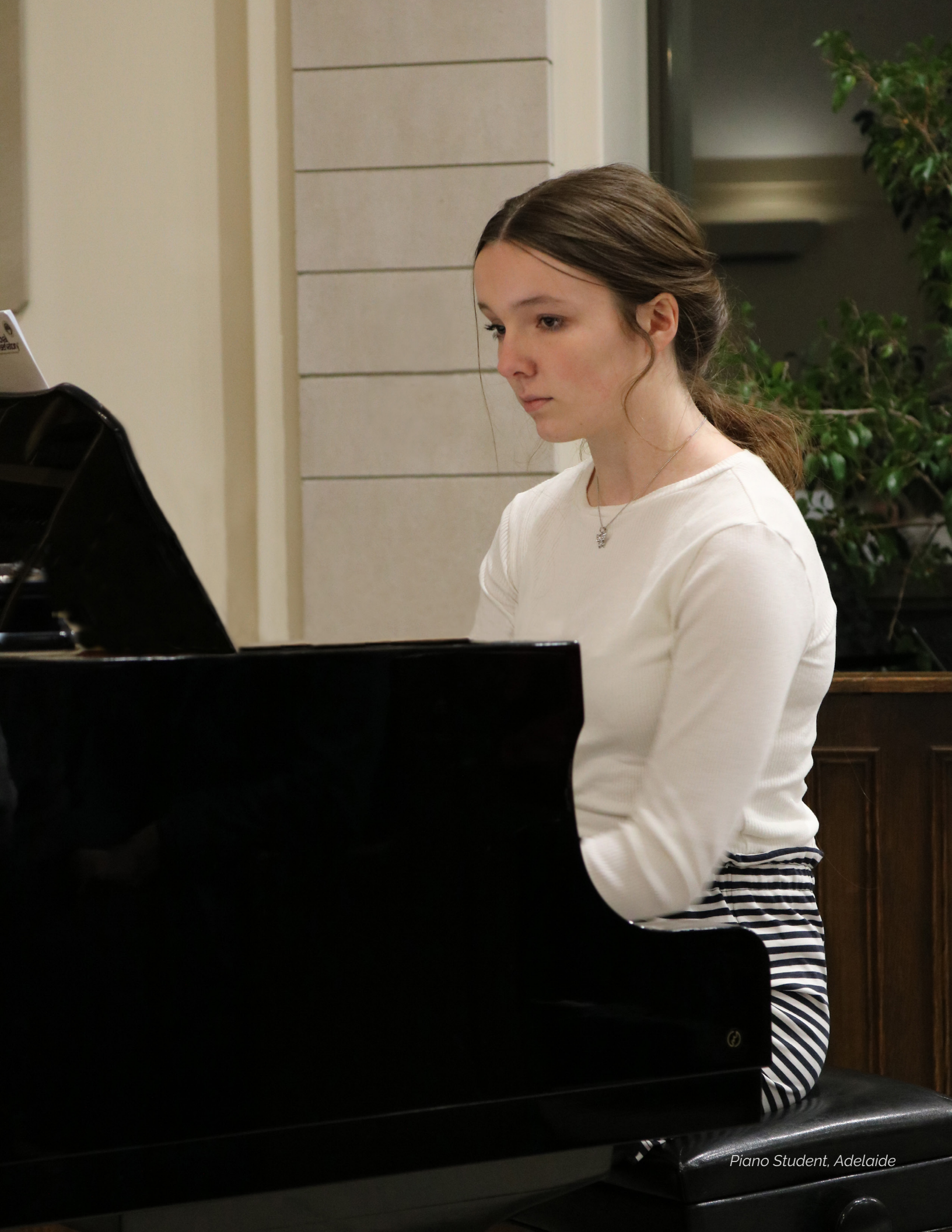
Piano Student, Adelaide